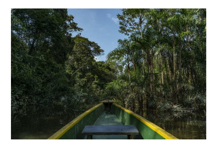
1 - Tiputini Biodiversity Station