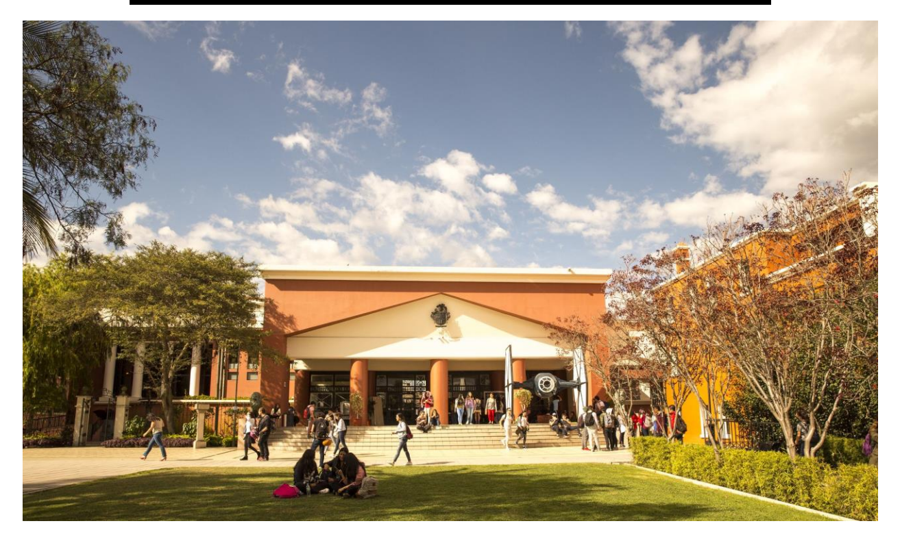
Founded in 1988, USFQ is the first private liberal arts university of Ecuador. Today, our university has more than 9,000 students and receives 1,000 international students per year. We are also ranked as #1 University in Ecuador and #60 in Latin America (QS University Rankings).